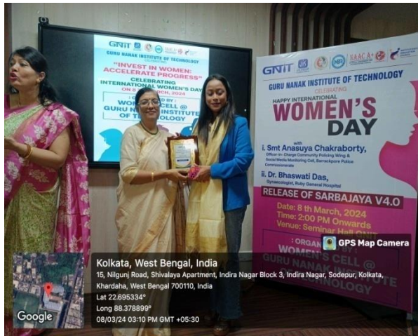
Snapshots of Celebration of International women's day at GNIT