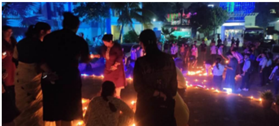
Snapshots of Pre-Christmas Celebration