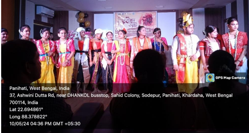
Glimpses of Celebration of Rabindra Jayanti at GNIT