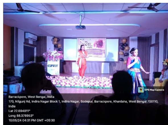
Glimpses of Celebration of Rabindra Jayanti at GNIT