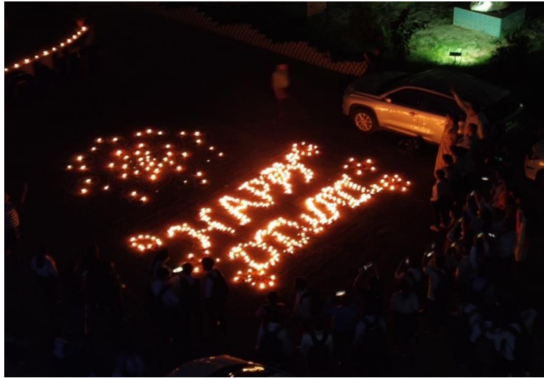
Snapshots of Deepavali celebration at GNIT