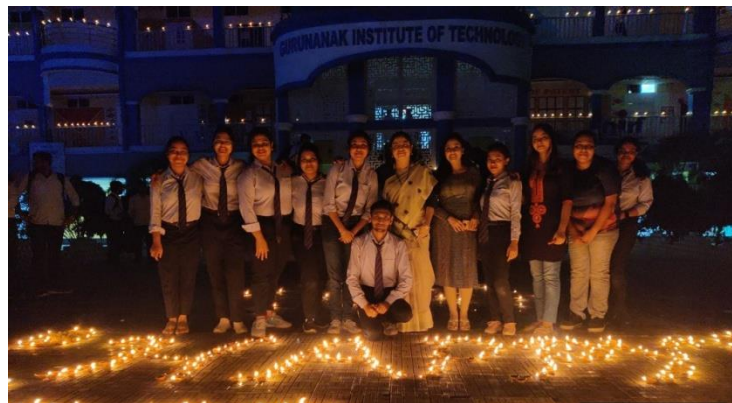
Snapshots of Deepavali celebration at GNIT

The Kali Puja & Diwali celebration on campus not only enriched the cultural experience of everyone involved but also emphasized the importance of coming together as a community to celebrate moments of joy and unity.