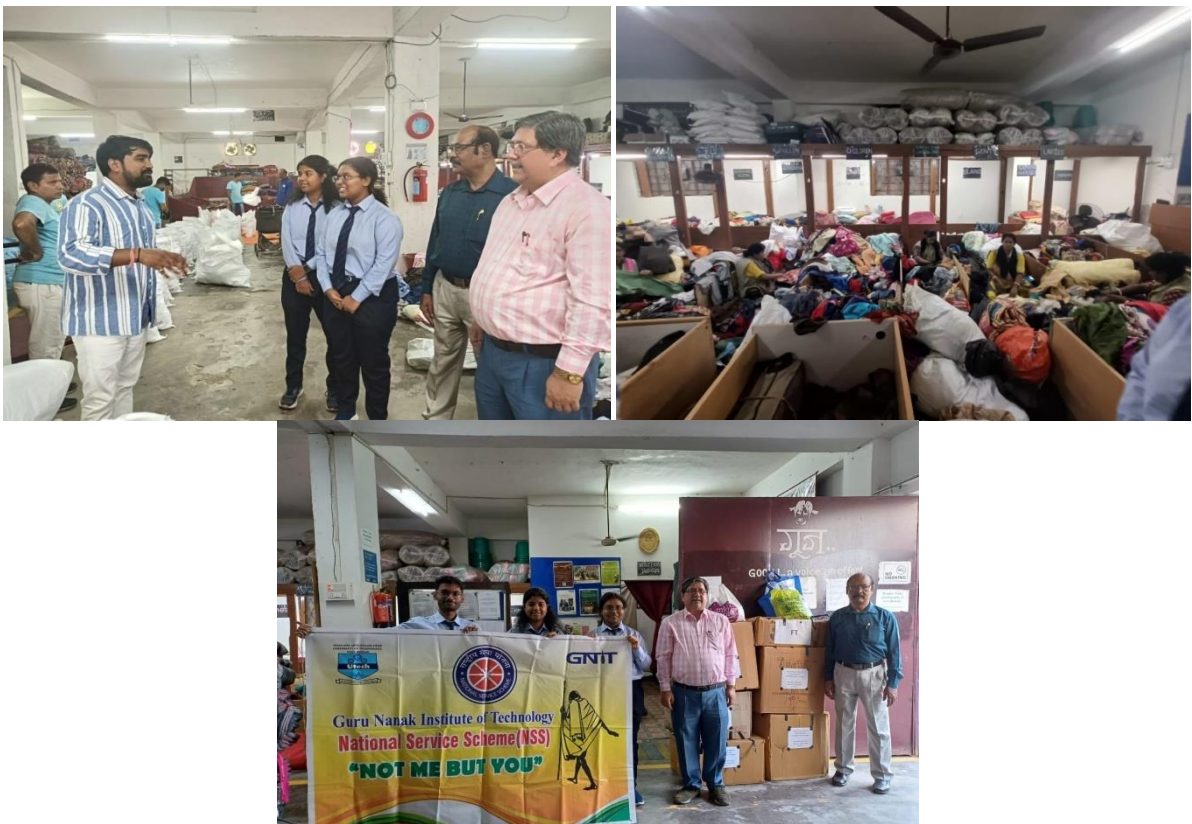
Snapshots of Donation Campaign at GOONJ

He also spoke of the pan-India network of Goonj, including 28 Indian States, and their efforts to promote developmental work in the remote, under-resourced villages through the “Clothes for Work”(“Kapdo ke liye kaam” ) initiative. He outlined some of the developmental efforts undertaken in the villages and stressed that Goonj’s emphasis was on preserving human dignity, rural development, health and conservation.