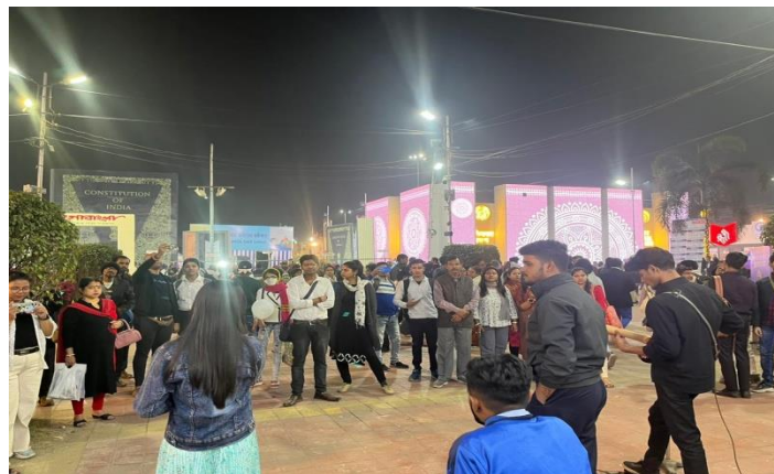
Snapshots of GNIT Participates in Kolkata International Book fair