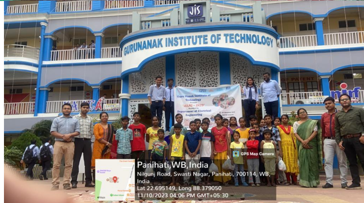
ULLAS – Spreading smiles