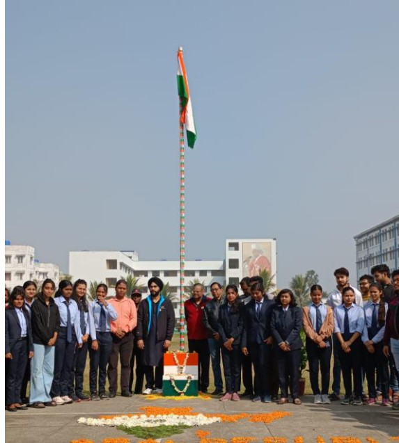
Snapshots of Independence Day celebration

The National Independence day is celebrated on 15 th of August at the institute. Students, faculty members and all the GNIT family members gathered at the campus and paid tribute to the motherland.