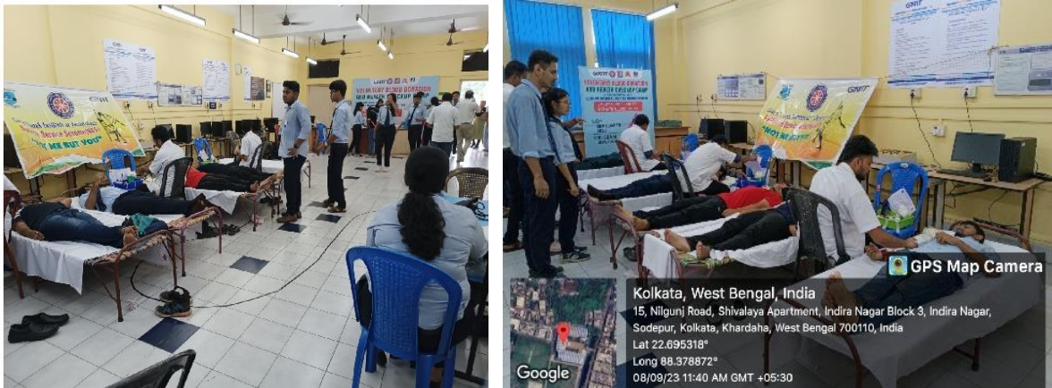
Snapshots of Blood donation camp was going on: Students, faculty and staff members were donating blood

11.00 a.m. where faculty and students from all the streams donated blood. There was an overwhelming response from students, faculty and staff members and 72 units of blood were collected from the camp.