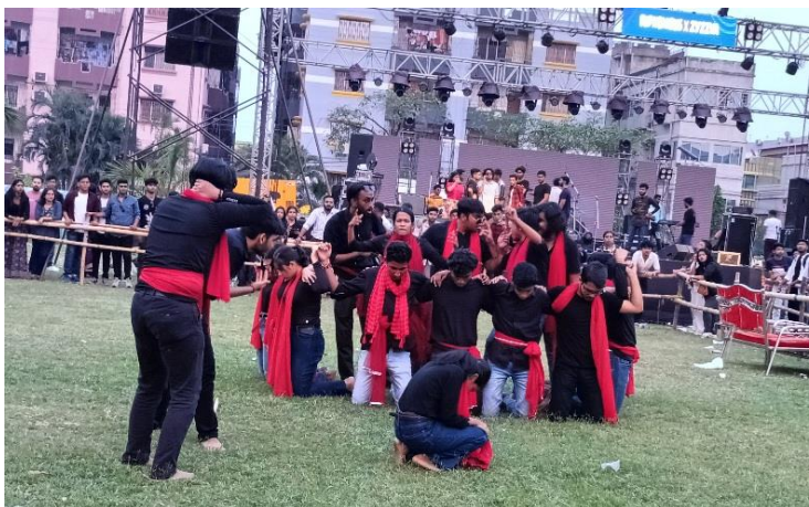
Glimpse of celebration to mark the beginning of Durga Puja 2023 - AGOMONI