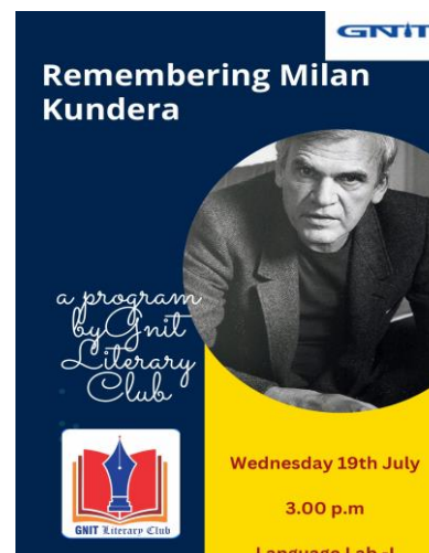
Snapshots of Remembering Milan Kundera – by Literary Club of GNIT