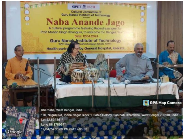
Snapshots of Bengali New Year – Borsho Boron celebration in the institute