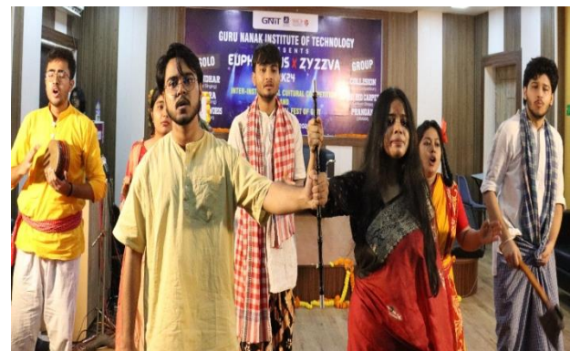
Snapshots of Inter-institutional Cultural Competition and Cultural Fest