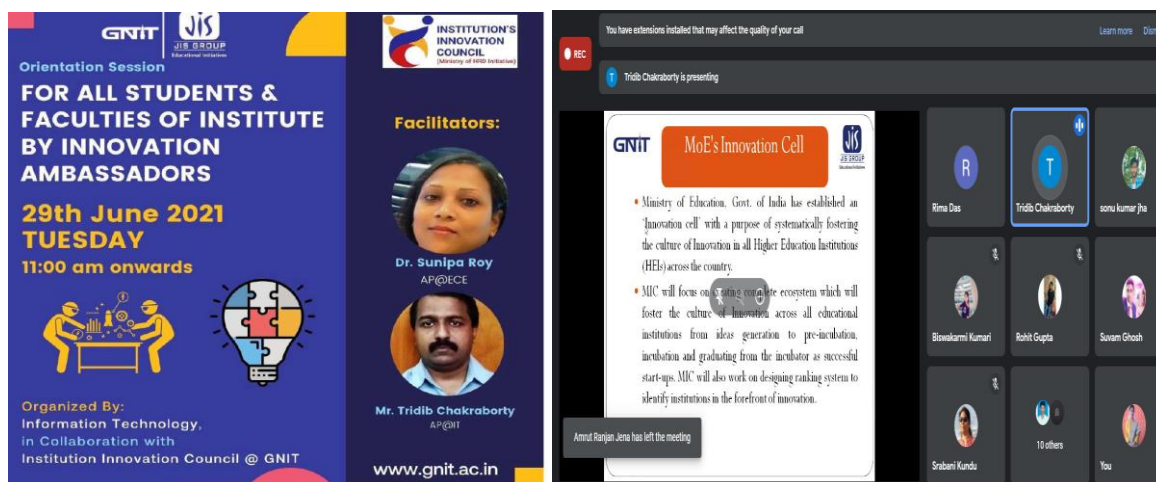
Orientation session for all students & faculties of Institute by Innovation Ambassador on 29/06/2021